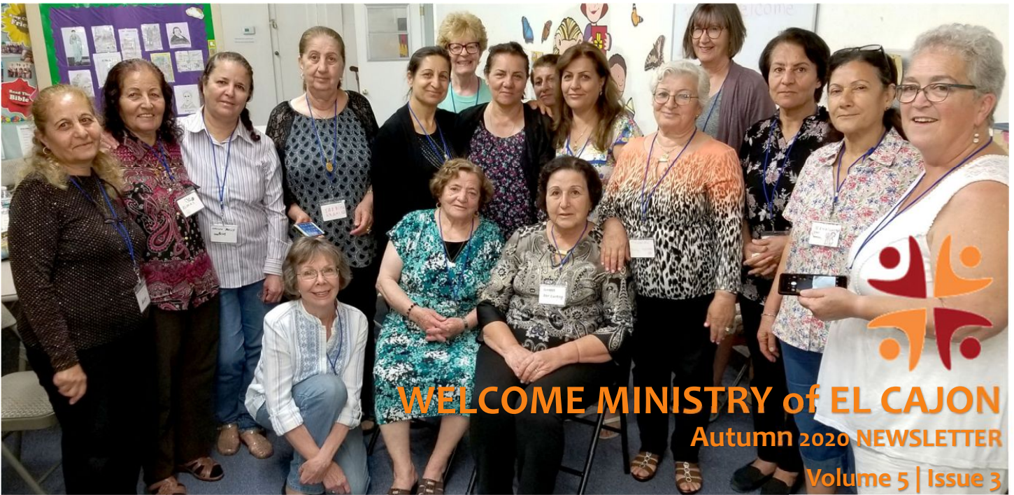
The friends of Welcome Ministry's Table Talk English as second language conversation group.